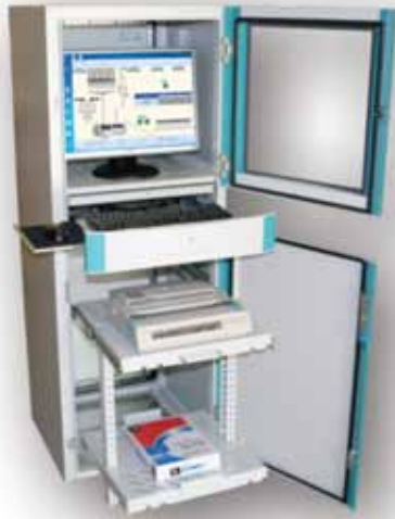
Industrial PC with mouse & keyboard control

We offer a full range of control solutions to meet your requirements: