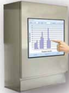
Industrial Touch Screen Terminals